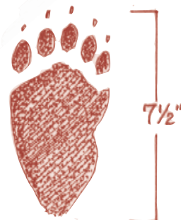
Back Paw Track