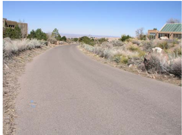
A photo taken after a heavy growth of Chamisa was cut back by the county.

I regularly jog in Sandia Heights and include a photo here of a roadway that used to be heavily overgrown with Chamisa bushes . One notes that on both sides of the road the Chamisa has been effectively cut back.