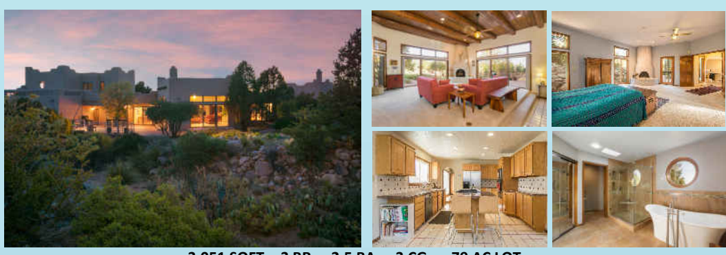
3,051 SQFT - 3 BR - 2.5 BA - 3 CG - .79 AC LOT

Beautifully updated Sandia Heights custom home that offers absolutely stunning/unobstructed views in a private setting. The Master BR & BA were remodeled in 2013 & feature a French Door entry, Kiva fireplace & nichos, dual walk-in closets, & a private courtyard. The spa-like bath offers dual vanities, a freestanding designer tub, and large shower. The light & bright Family Room offers a T&G + beam ceiling, built-in cabinets & shelving, and a wall of windows/sliders that show off the stunning views to the east. The Kitchen is a chef's dream! Featuring beautiful granite counters, SS appliances, & a large island. Secondary BR's up w/full bath & large balcony. The private backyard offers a deck, open patio space & stunning views. The perfect place to entertain! New Septic Tank 6/2017. Offered At: $599,900